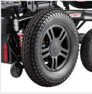
15" drive wheels