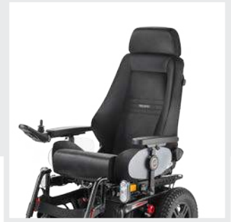
Recaro seat in black Artificial leather