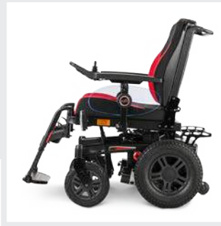
Black-red RS design