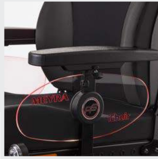
Side guard lighting with custom engraving