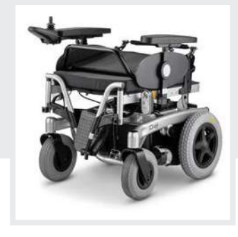
Long-life LED light