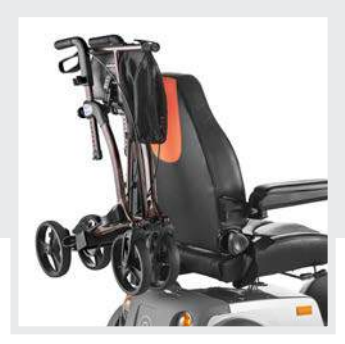
Holder for the Mobilus rollator