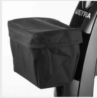
Weather protector for shopping basket