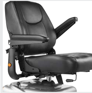
Seat and armrest adjustment