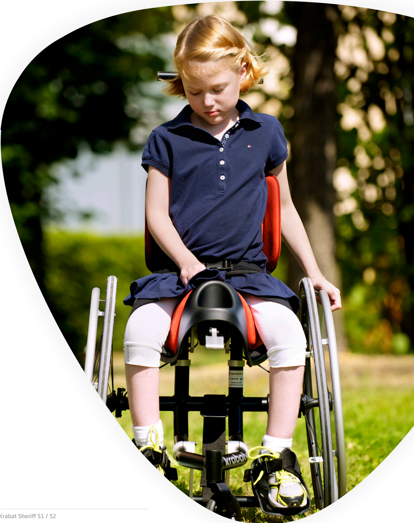
Krabat Sheriff S1 / S2