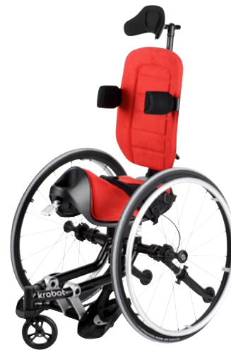
Plus backrest for additional upper body support