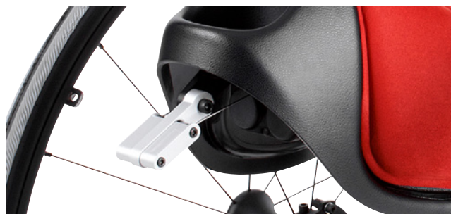
Easy accessible brake handle