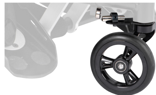
Compensation mechanism for one-hand driving