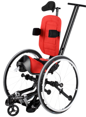
A push bar is available, and is easily mounted and dismantled