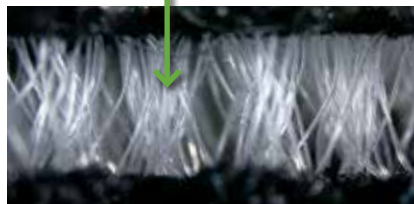
▲ Spacer fabric in cover.