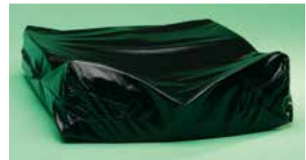
▲ Inner incontinent resistant cover, shown from the rear.

The cushion contour, spacer fabric outer cover and inner incontinent resistant cover all work together to keep the user and cushion dry. The inner cover really works. There are no seams or zippers in the path of liquid drainage, ensuring the cushion will not absorb moisture. Large accidents or spills simply pour off the back of the cushion.