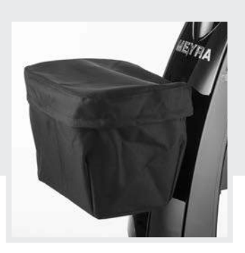
Weather protector for shopping basket