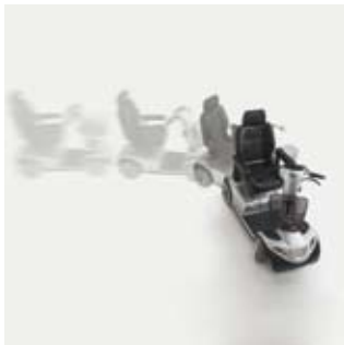
Automatic speed reduction For added safety, the Orion automatically reduces speed around bends.