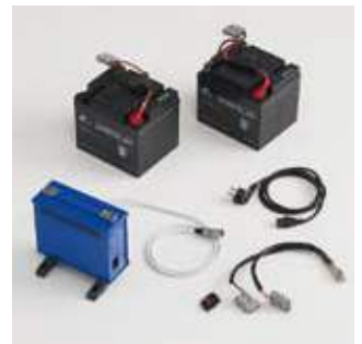
Off-board charging Simply remove batteries to charge with the off-board charger kit.