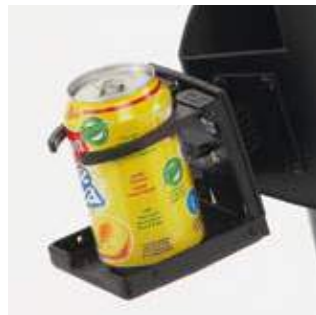
Cup holder Stores a soft drink.