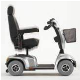
Seat suspension module Adds extra comfort during driving.