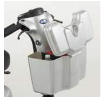
Lockable front box Secure box for personal valuables.