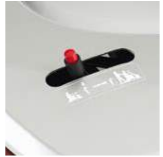
Two-step disengaging lever Prevents the scooter from accidentally free-wheeling.