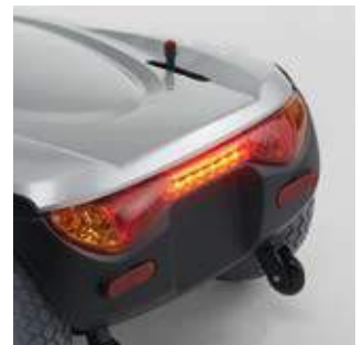
Brake light Heavy duty brake lighting warns people that the scooter is slowing down.