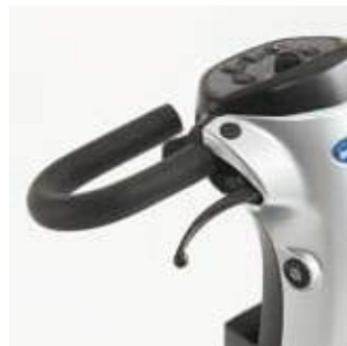
Hand brake Ensures immediate braking if required.