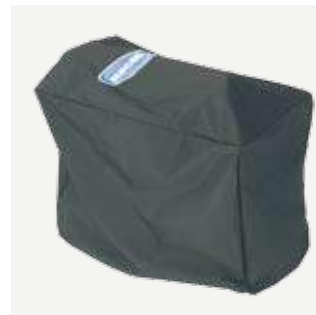
Heavy-duty storage cover Keeps the scooter clean and dry.