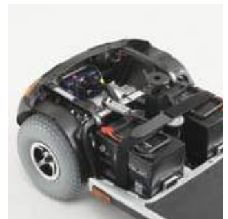
Built-in anti-splash guards Protects electronics and transaxle from dirt and water.