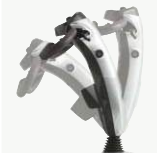
Easily adjust the angle of the tiller