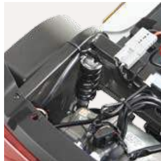
Suspension A fully-suspended chassis provides a comfortable drive at all times.